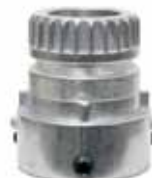
Bosch adaptor BOA1G2

Adaptors for Bosch®, Hitachi®, Makita® collated screw guns are also available.