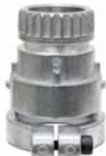
Makita adaptor MAA3G2