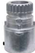
Hitachi adaptor HIAG2