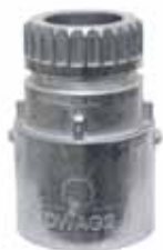
DeWalt adaptor ADDWG2

Adaptors for a DeWalt®, Makita® or Milwaukee® screw gun are available separately.