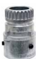
Milwaukee adaptor ADMILG2

Adaptors for Bosch®, Hitachi®, Makita® collated screw guns are also available.