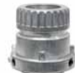
Makita collated adaptor ADM31G2

Please visit www.quikdrive.com to see our full line of tools and specialty fasteners.