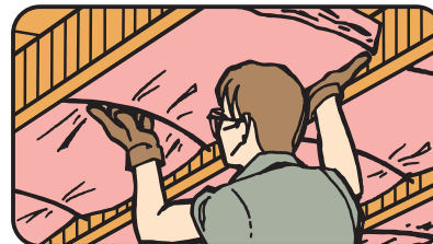
Typical IS24 installation