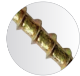
Coarse thread ideal for drywall to timber applications