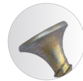
Bugle head for countersink finish in drywall