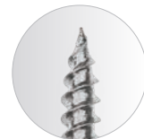
Sharp point for easy starts into timber

Collated Screws for the Quik Drive® System