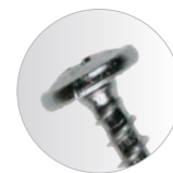
Wafer head for a low profile finish