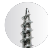
Sharp point for fast starts